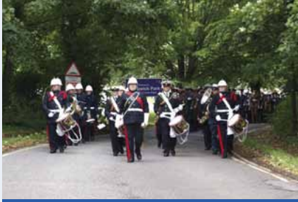
ARMED FORCES DAY