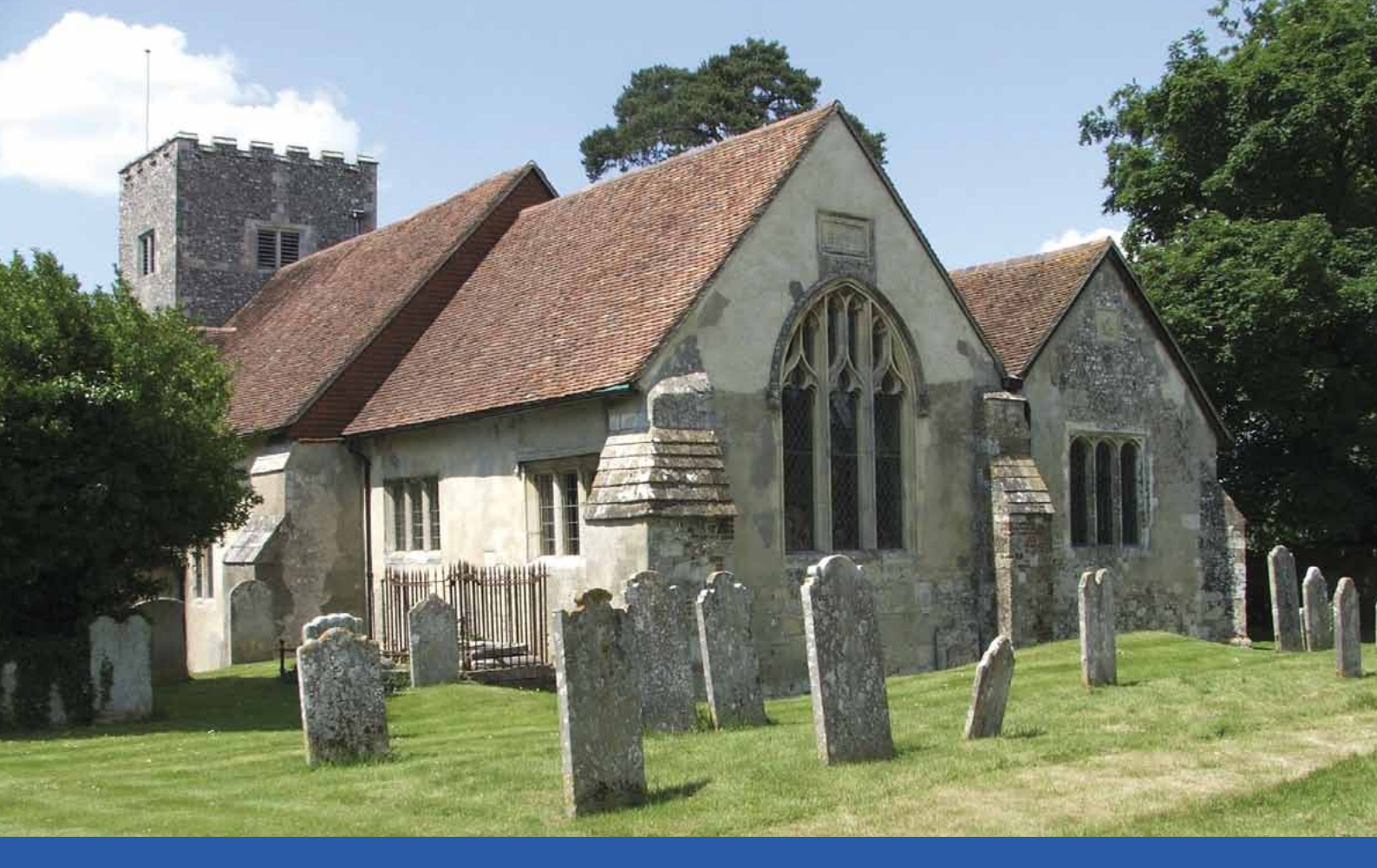
A Visitors Guide to St. James Without-the-Priory Gate