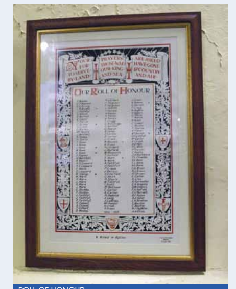
ROLL OF HONOUR

Immediately on your left, on the west wall, you will see a framed ROLL OF HONOUR commemorating those from the villages of Boarhunt and Southwick who served during the 1914-1918 war. The names marked with an asterisk signify those who lost their lives and they are further commemorated in the war memorial on the north wall of the church.